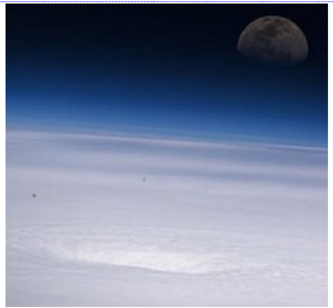
The eye of Hurricane Emily photographed from the International Space Station.

For information about Rookery Bay or Florida's estuaries, visit www.dep.state.fl.us/coastal/ . For more about the Friends of Rookery Bay, visit www.rookerybay.org .